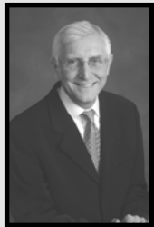
Ron Moore, Minister of Education