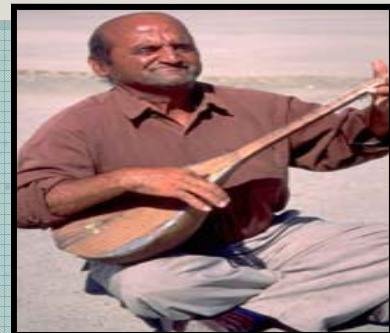
Prayer is the first and most important contribution you can make to impact the Persians of Iran people.

To send a prayer request to FBC . . . prayer@fbct.org