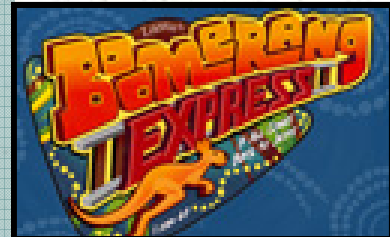
God loved us and sent his only son, Jesus. I John 4:9