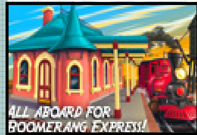
“Pray that the glory of God would cover VBS and that many will accept Christ as Saviour!”