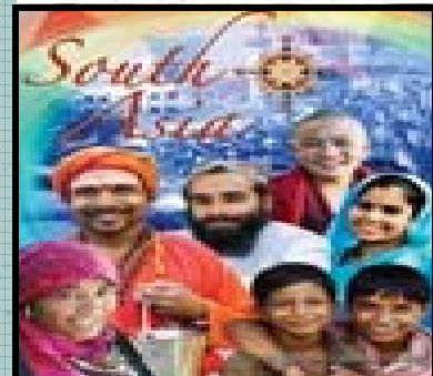
..first of all, supplications, prayer, intercessions and giving of thanks, be made for all men. I Timothy 2:1