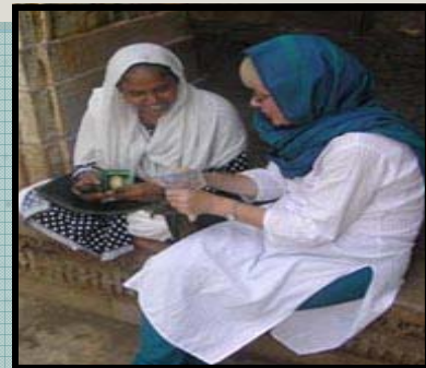
Prayer is the first and most important contribution you can make to impact the people of South Asia.